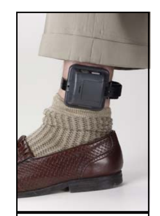
Secure Continuous Remote Alcohol Monitoring Devise (SCRAM)

Alcohol is eliminated from the body by two mechanisms: metabolism and excretion. Metabolism accounts for greater than 90% of ingested alcohol and occurs principally in the liver. The remaining 10% of ingested alcohol is excreted, unchanged, wherever water is removed from the body—breath, urine, perspiration, and saliva. The excreted alcohol is significant because it can be measured and correlated to a person's Blood Alcohol Concentration.